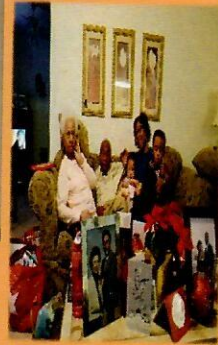
And Her Beloved Family Members